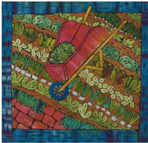
Red Wheelbarrow by Laura Wasilowski

$20 Kit Fee: Includes hand out, hand-dyed fabrics and threads, and needle.